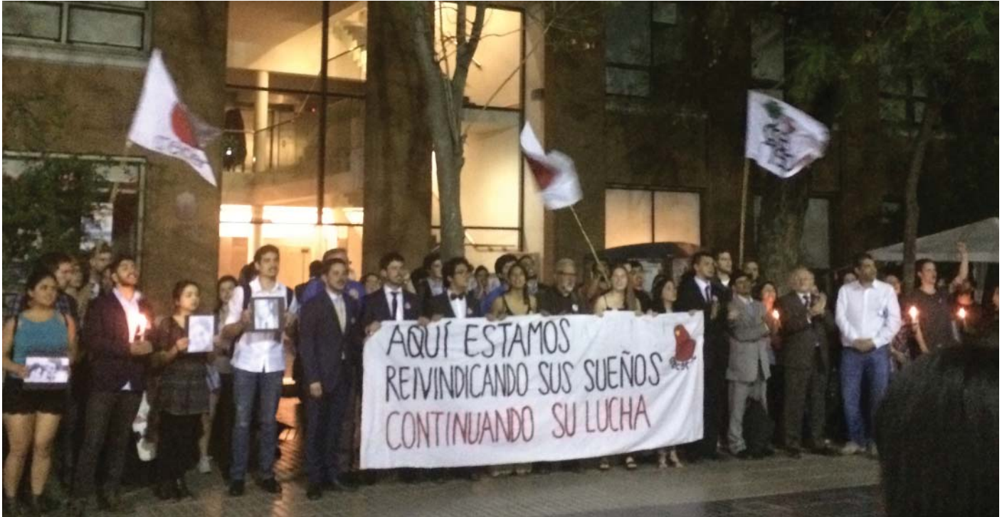
Figure 4 Crecer's candlelight demonstration

UC community. Upon leaving the ceremony room to the outdoor plaza, all attendees saw a semi-circle of 30 Crecer militantes , each holding a photo of a detenido/desaparecido (detained/disappeared person) from La UC, and holding a candle (Figure 4). This was the scene that welcomed the PUC community—including deans, the Rector, other Vatican-affiliated community members, and students of all ideologies, as they came out of this formal, traditional ceremony. The students stood in silence with solemn faces, showing the faces of those who were lost. Then, the FEUC list of five joined them carrying their banner about reclaiming the dreams of those who had been lost, and then for ten minutes, they began reciting all of their different chants—some of which are adopted from the student movement, others of which are specific to Crecer and were used during the campaign. The use of the formal and traditional space of the UC ceremony, in light of the second Leftist win of the UC in more than a hundred years of history, with a candlelight vigil of all the detained/disappeared students from La UC from the dictatorship was a powerfully politicizing statement by Crecer to resist the violence their community has always faced, and will continue to face in the conservative stronghold.