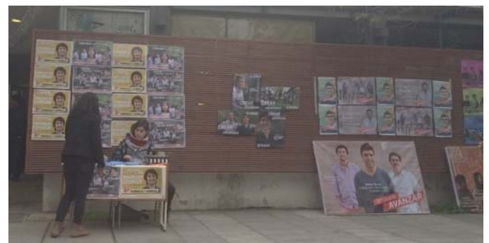
Figure 1 Campaign posters from all four movements (left to right): Crecer, Nueva Acción Universitaria (NAU), Solidaridad, Movimiento Gremial (MG)

Crecer, a Left-wing platform, is a unique coalition of university political movements—La Union Nacional Estudiantil (The National Student Union), Acción Libertaria (Libertarian Action), Frente Estudiante Libertario (Libertarian Student Front), Trazo Comun (The Common Line), and FAS. Students can join Crecer if they belong to any of these movements, which pertain to university-level parties across the country, and/or if they are independent. Crecer’s foundation of these different movements, which can be described as a coalition of usually warring Leftist parties, as seen in other universities, is unique and very effective in combining many different Leftist ideologies into one coalition, which is self-reportedly an advantage in what is described as a “hostile” conservative environment, such as La UC. While it has strong bases in the Social Sciences and Humanities, it did not have enough strength in the school in comparison to the legacy of NAU or the huge voto duro of MG. In the history of its five-year-old platform, Crecer has often been viewed as militant, denunciatory, or too extreme for the neutral/apathetic students in La UC, though students from other universities report that Crecer