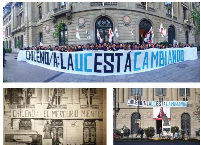
Figure 5 “Chilean: La UC is changing” banner held by Crecer students in 2015 on the morning of their win in front of the oldest, original UC campus, Casa Central in the center of Santiago, Chile. This is shown in comparison with a similar banner held up resisting the dictatorship and exposing the biased, regime-backed newspaper El Mercurio. It says “Chilean: El Mercurio Lies” in 1977.

dictatorship. These wounds include the living ones—that the Chicago Boys continue working as professors, as well as the past wounds that continue to influence the present—La Católica was the cuna of neoliberalismo (nest of neoliberalism), and that it was the birthplace of Jaime Guzman, MG, and